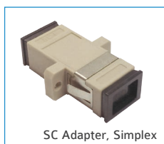
SC Adapter, Simplex