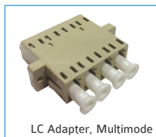
LC Adapter, Multimode