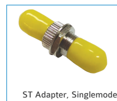
ST Adapter, Singlemode