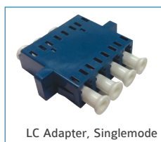
LC Adapter, Singlemode