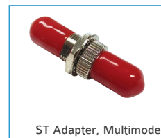
ST Adapter, Multimode