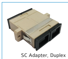
SC Adapter, Duplex